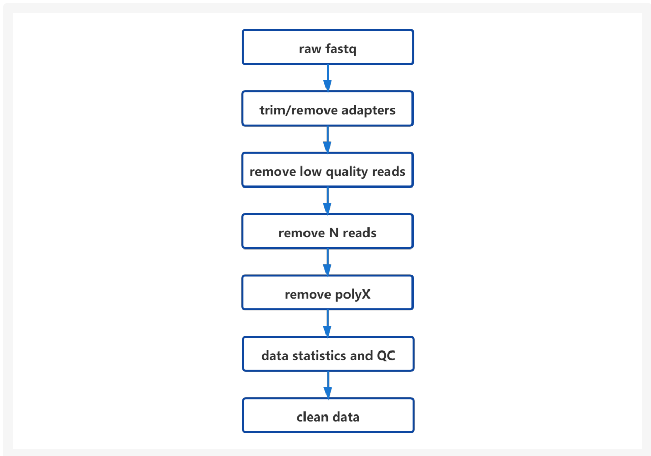
Figure 3 Bioinformatic analysis workflow.